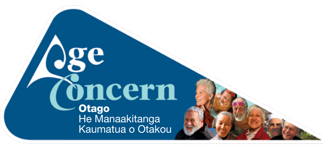
Celebrating Otago's older people since 1948

Age Concern Otago has worked to celebrate and promote the wellbeing and quality of life of older people, koroua, kuia and their carers since 1948. Positive Ageing means promoting independence through a range of supportive services; social work, advocacy, health promotion projects, falls prevention programmes, education, information and referrals aimed at supporting and empowering older people to make informed decisions. Age Concern provides trusted information and advice, enabling solutions to reduce anxiety, lessen isolation, improve coping strategies and to rediscover a sense of empowerment.